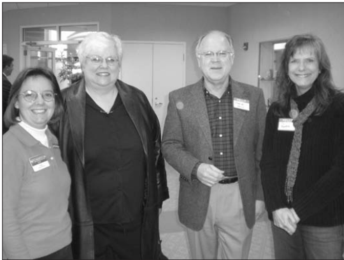
Happy NELBA members and guests at the January luncheon meeting.