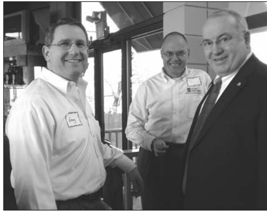
Great business contacts are made at NELBA's monthly Captain's Quarters networking events