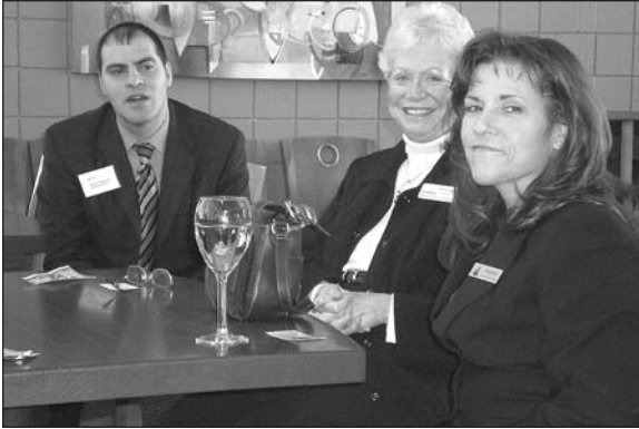
Happy NELBA members at the CQ networking event.