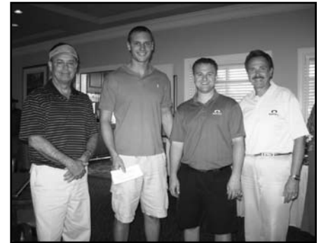
3rd Place Golf Scramble Winners