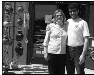
Amazing Green Planet -Westport Village Reception