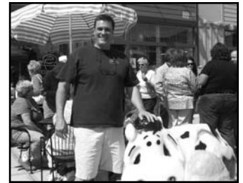
The Comfy Cow hosts refreshments