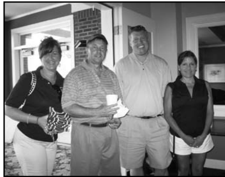
Golf Scramble Planners