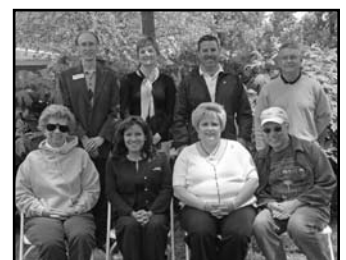
Art in the Arbor Award Ribbon Sponsors