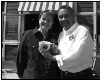
La Vida Java hosts Interchange reception