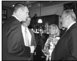
4 Flights wine tasting