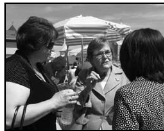
NELBA ambassadors attend the Westport Road Interchange ceremony