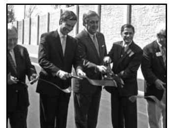
Dignitaries-Westport Road Interchange