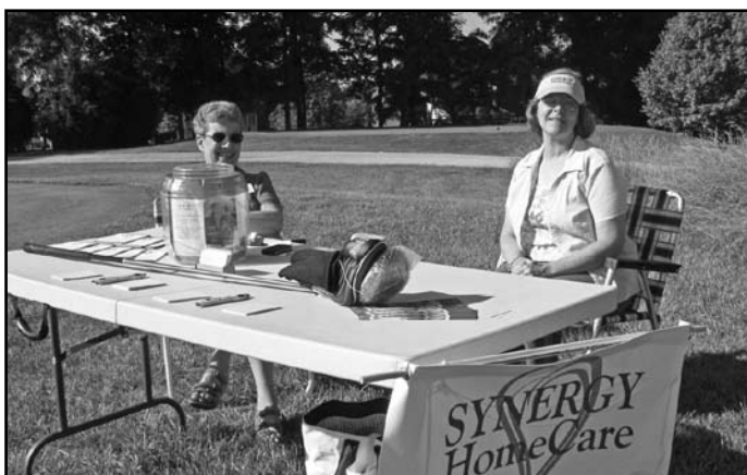
Synergy Home Care Hole Sponsor