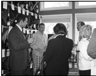
4 Flights Open House