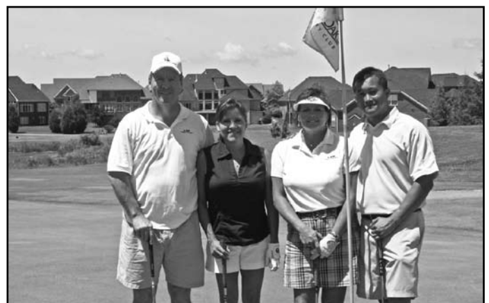
L & N Federal Credit Union