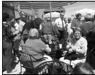
Neighbors enjoy Westport Village Reception