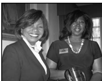
Speaker thank you!