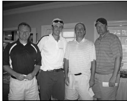
2nd Place Golf Scramble Winners