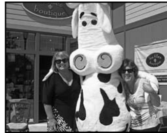
Les Filles Boutique at the Reception