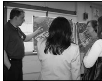
Planning and Design public meeting