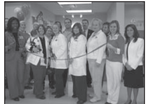
The Little Clinic celebrated its presence at both Kroger stores at Holiday Manor and Springhurst.