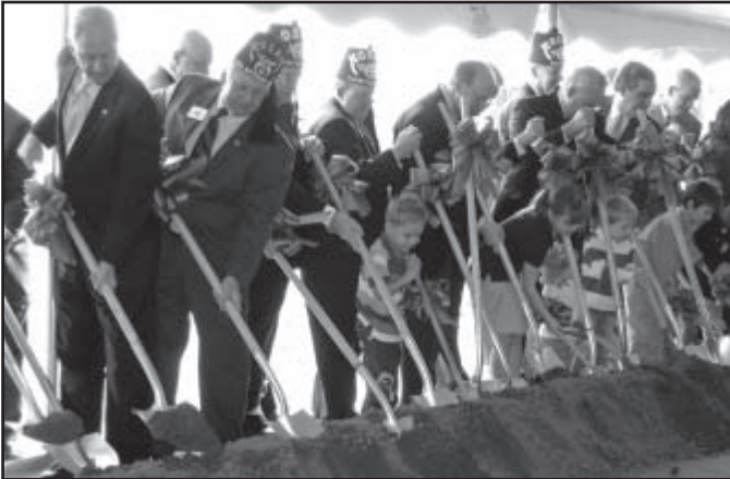
Some 300 people attended yesterday's groundbreaking ceremony for our new pediatric outpatient center, to be built adjacent to the Norton Brownsboro Hospital campus. When it opens around June 2010, the new facility will include a pediatric 24/7, 365 emergency department; a pediatric diagnostic imaging center; and pediatric outpatient surgery. It will feature the same high standard of patient care that the community has come to know and trust at our downtown Kosair Children's Hospital.